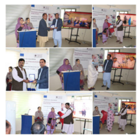
Some of the most prominent and widely read newspapers and media agencies of the region extensively covered these events.

Funded Programme has decreased the number of poor households in district Kech by 20 percent.