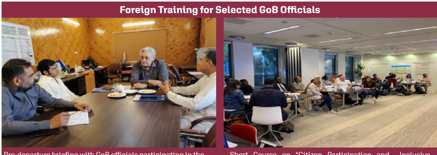
Pre-departure briefing with GoB officials participating in the Short Training Course, "Citizen Participation and Inclusive Governance" at HAFLG organised at BRACE TA Office on 8<sup>th</sup> June 2022