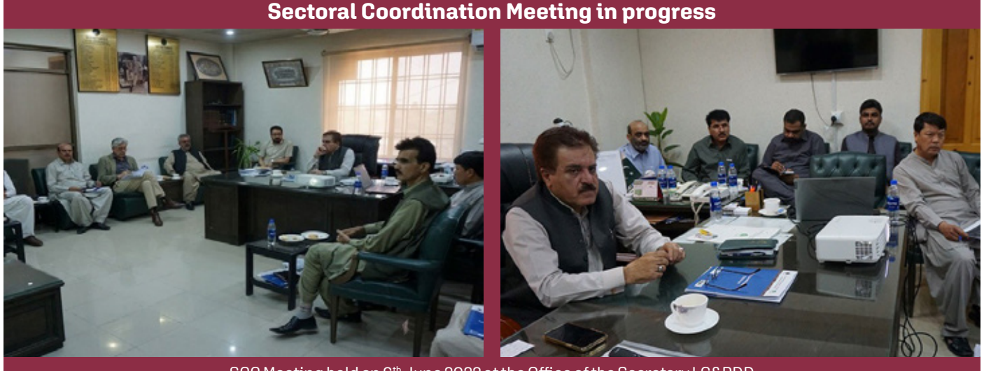
SCC Meeting held on 6 ^{\rm th} June 2022 at the Office of the Secretary LG&RDD

and Planning Guidelines. а holistic approach to bottom-up socio-economic development & poverty alleviation. quidelines Community Physical for Infrastructures and the Monitoring, Evaluation. Accountability. & Learning (MEAL). The SCC Meeting adopted the final draft of the Community-Led Local Governance (CLLG) Policy and CLLG Policy Framework for further processing and submission for adoption by the relevant GoB competent authorities.