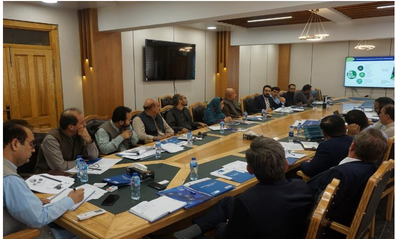
The BRACE SPDC Meeting endorsing the Balochistan Community-Led Local Governance (CLLG) Policy

Following through on the Balochistan LG Act Amendment (Section 87), the CLL Policy will regulate how Community Institutions can access, or benefit from public sector funds, and become a full partner in the GoB Local Governance and local development processes, which aim at increased service delivery to the rural and urban poor.