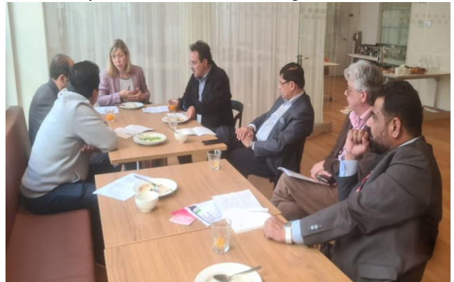
Meeting on Twinning linkages between DG BRDA and the Hague Academy for Local Governance, in The Hague, Netherlands