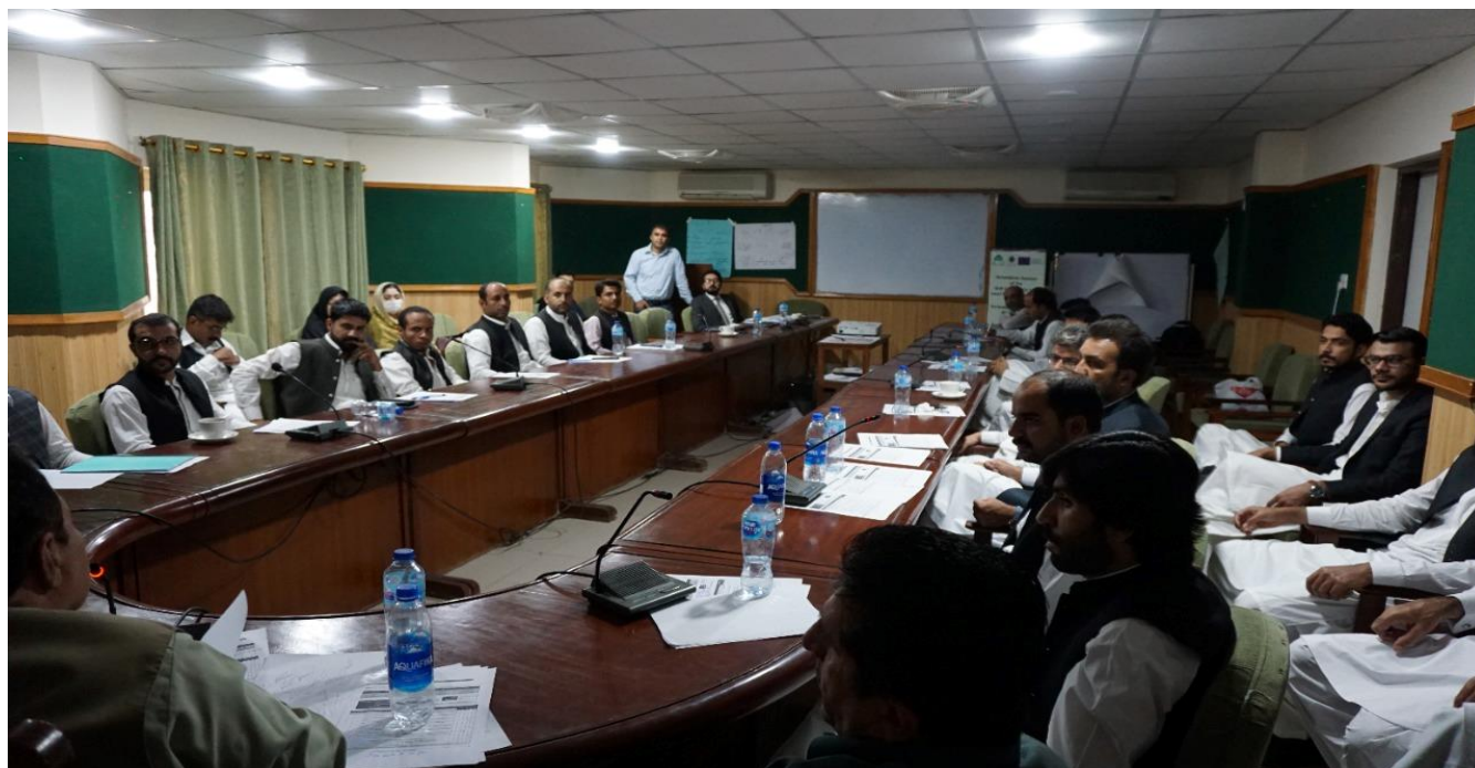
One-Day Session on GoB Community Led Local Governance Policy for LGRDD Pre-Service Training Participants

The one-day session touched on the important concepts, systems, procedures and institutional setup of the CLLG Policy. The trainees were also informed that once the GoB formally adopts the CLLG policy and becomes operational, the TA will organize with the BRDA, detailed and operational district level training of the staff of the local government department, other line departments including other non-government key stakeholders.