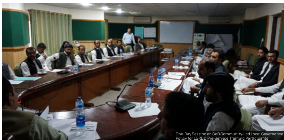
One-Day Session on GoB Community-Led Local Governance Policy for LGRDD Pre-Service Training Participants

With the GoB Community-Led Local Governance (CLLG) Policy in its final phase of adoption by the relevant Government of Balochistan Authorities, it is expected to become