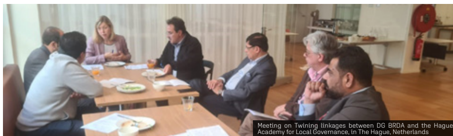
Meeting on Twinning linkages between DG BRDA and the Hague Academy for Local Governance, in The Hague, Netherlands

The Hague Academy for Local Governance (HAfLG) is a globally reputed institute that possesses technical capacity to provide capacity-development training courses, training modules & manuals based on global best practices and new & innovative local governance initiatives that are directly related to the CLLG Policy Reforms, and the HAfLG has provided "institutional and